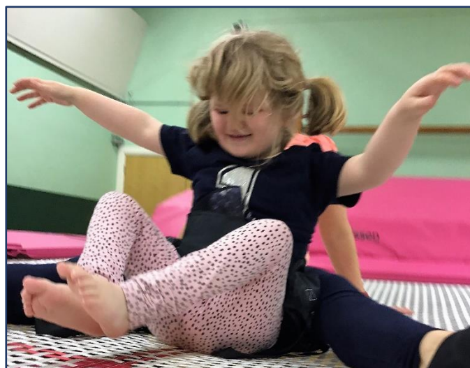
Rebound therapy is now available thanks to FOPS

We have also focussed on continuing to improve our school learning environment. Earlier this year, we had a communication and social interaction hub installed in the atrium. A new hoist