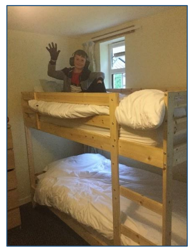
Kyle at Macaroni Wood

Maple Class have begun to think about their independence skills by making their own lunches, which involved making soup, toasted sandwiches and learning how to use kitchen equipment safely