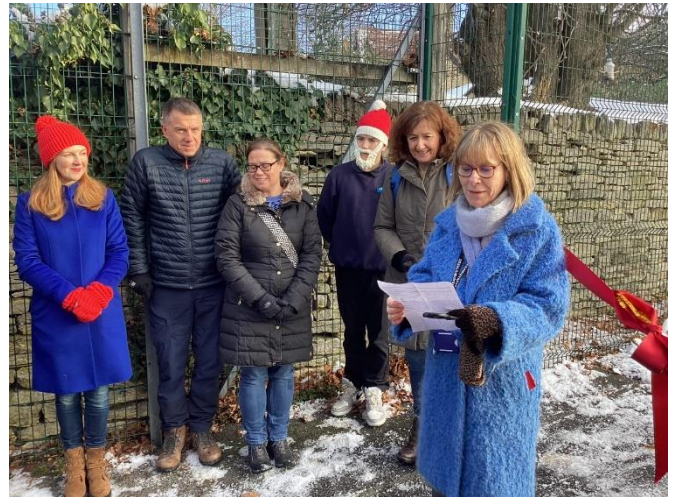
We were thrilled to formally open our new playground with donors and Friends of Paternoster School

It was wonderful to finally be able to welcome the donors and Friends of Paternoster to celebrate the opening of the playground. The playground opening had been delayed by the Covid-19 pandemic and then unexpected snow threatened to scupper the opening. Although our