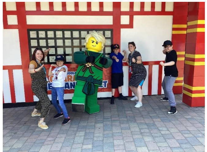
Our day out at Legoland was a huge hit. Children from Beech and Chestnut classes loved the Ninjago area.

FOPS have also funded our school prom, our celebration for the pupils leaving us at the end of year. This year we have 11 pupils leaving us and moving on to a range of colleges and post-16 units. Some of those pupils have been with us since they were small children and it will be very strange not to have them around next September. However, I feel confident that their time at