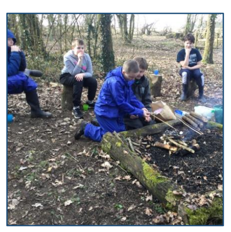
Beech class have been enjoying Forest School this term, we have been refining our whittling skills in preparation for toasting marshmallows on the campfire. We also designed and created our own pizza, nicknamed the 'Sweetza' for the Red Nose Day competition.